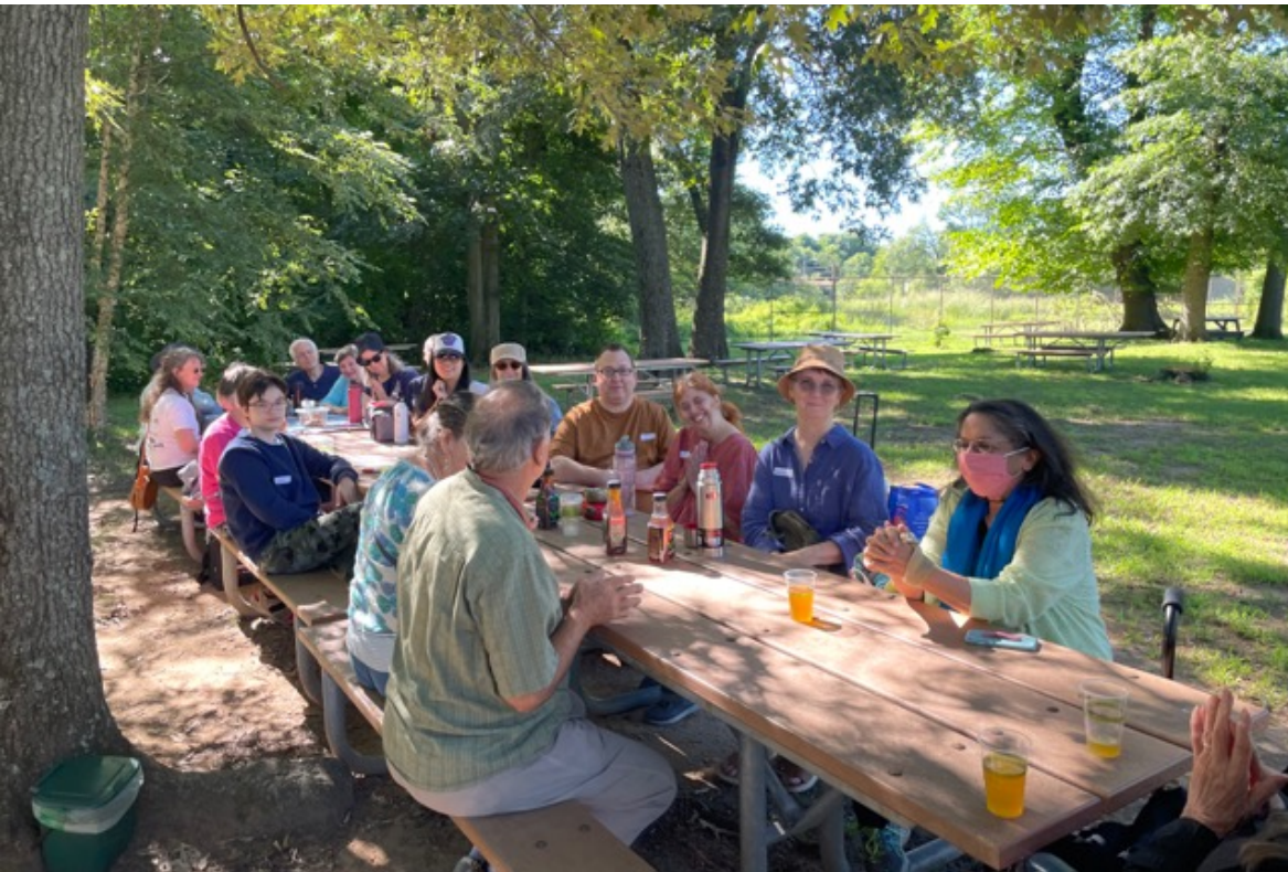
Lotus Viewing at Kenilworth Park & Aquatic Gardens, August 13, 2022