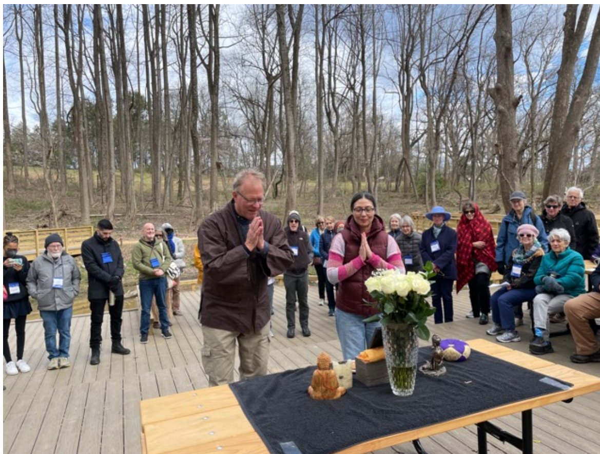
Honoring and Remembering Thay – A Silent Walk and Gathering, March 20, 2022, at the Woodend Sanctuary in Chevy Chase, Maryland

The passing in January of our teacher, Thich Nhat Hanh (Thay), has taught us in a profound way about continuation and interbeing. People all over the world watched the days-long funeral rites carried out by the monastics of Thay's root temple in Hue, Vietnam, where he became a novice monk at the age of sixteen. In March, Still Water held its own commemoration, a Silent Walk and Gathering to Honor and Remember Thay, at the Woodend Nature Sanctuary in Chevy Chase, Maryland. Thay lives on in each of us: we experience his presence in our sangha meetings, and his teachings illuminate our gatherings.